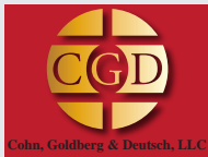
Cohn, Goldberg & Deutsch, L.L.C.

Is recognized nationally in the mortgage default legal services industry as a preeminent firm and is Martindale-Hubbell AV rated. Firm members have provided outstanding representation in Maryland and DC for more than three decades, while finding cost-effective and time sensitive solutions for their clients. The firm adheres to strict compliance standards, while solving complicated legal issues. Having received numerous industry awards, the firm has distinguished itself among its peers. Its members have served in positions of national and state leadership, served as industry speakers, and authored dozens of articles. The firm was also instrumental in changing the process in Maryland that saved creditors millions of dollars. We strive to create relationships with our clients based on trust and performance.